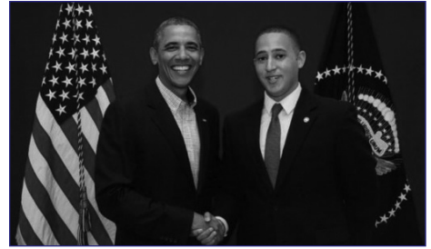
Svante Myrick '09, mayor of Ithaca, with President Obama in January.