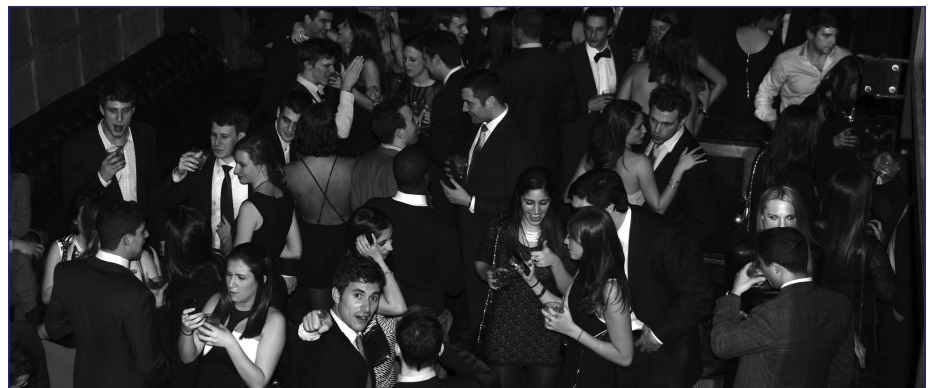
Alumni brothers and their dates enjoy an alumni formal at Avenue Nightclub in New York City.