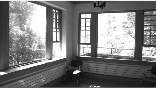
A bright corner of our new lake view lounge.