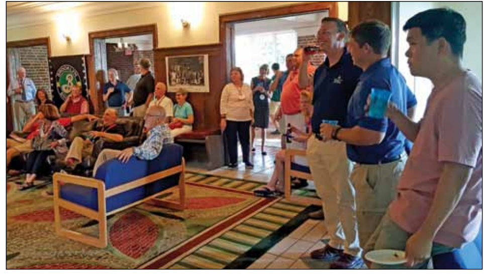
SRO crowd at Hillcrest on June 10 for Reunion.

periences at Hillcrest—makes it easy to form the board sat in and contributed to the new friendships, even across generations. (continued on next page)