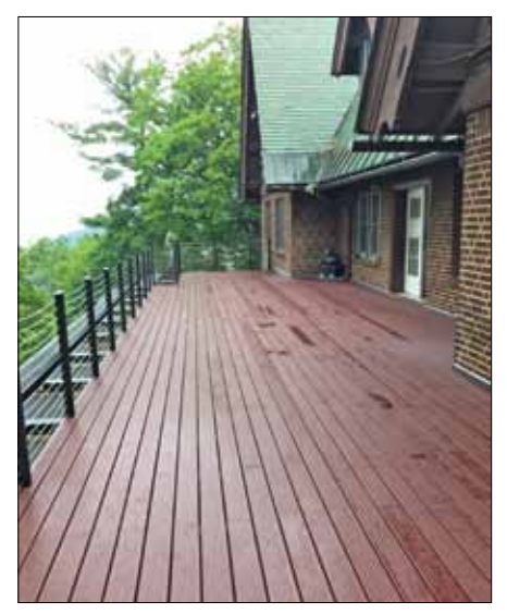
The new deck: a thing of beauty!

Although the project was finished a little late, the new deck is a thing of beauty. We've included a photo here, and there are more at the facilities link on our website. Thanks to generous alumni contributions, our brand new deck is safe, beautiful, and fitting for Hillcrest's future. The deck remains a key feature of NY