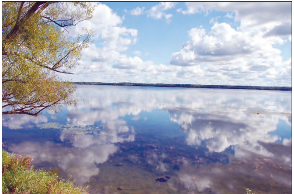
Ithaca's calling: "Come back for Reunion!"

We forgot to include the information leaflet about matching gift companies in our recent (Reunion) mailing. It is enclosed with this newsletter instead, with our apologies.