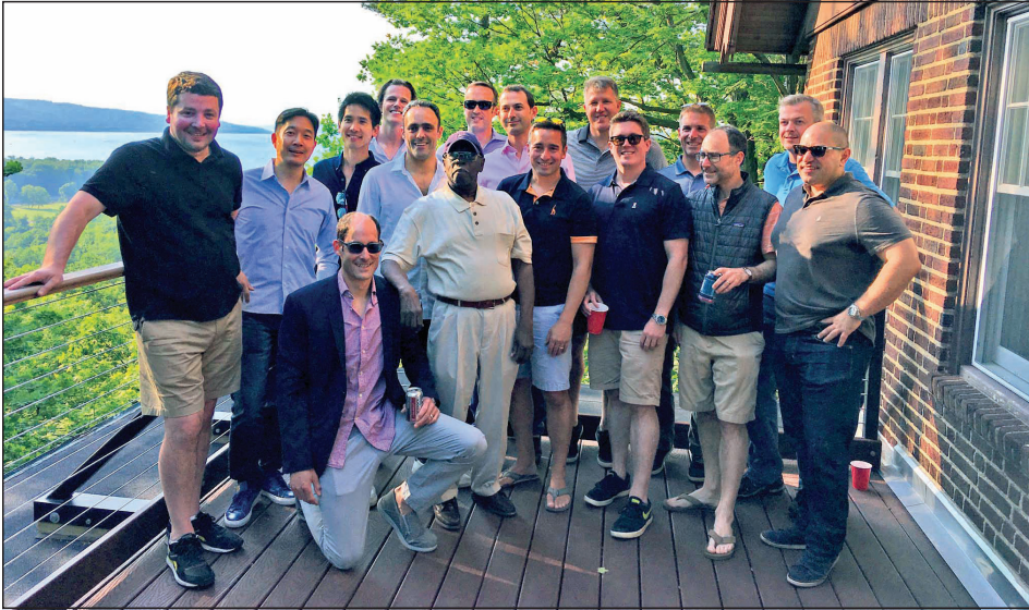
Class of '98 alumni pose for a shot on our new deck.