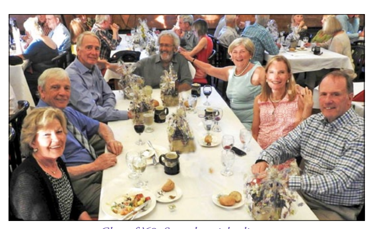
Class of '69: Saturday night dinner.