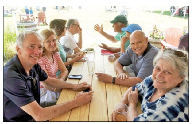
Class of '69: Friday beer lunch.