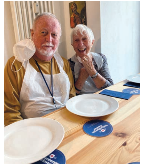
Taken after a sausage-making class in Regensburg, Germany last November 2021.