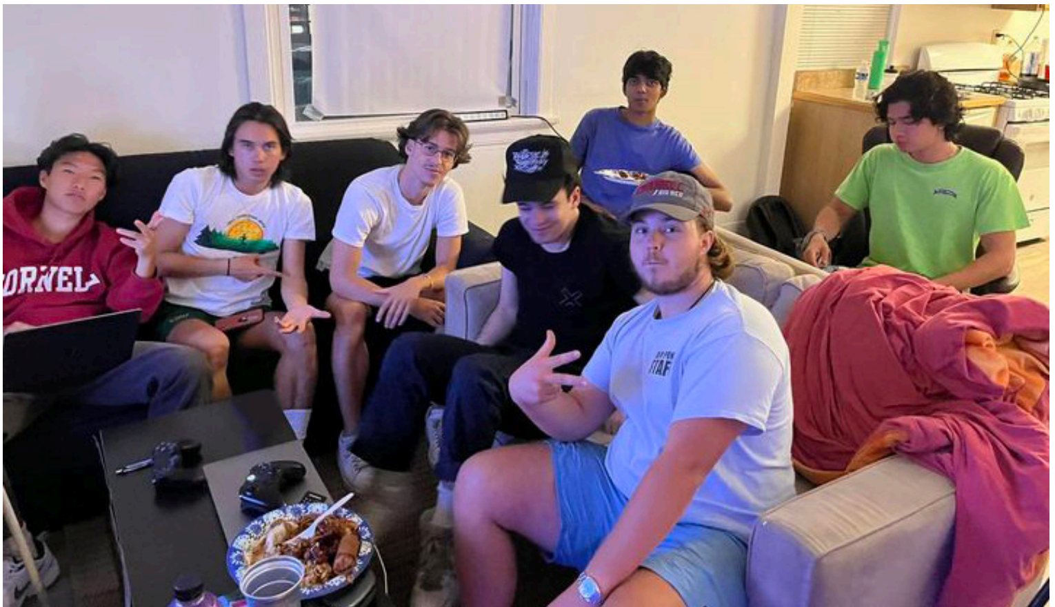
ΣAE current chapter

I have made an attempt to connect with all of you, to hear your stories of what made ΣAE so special, and how we can integrate it into the fabric of this new chapter of our history. Stories of battles with Alpha Delt, the Hot Truck, and wild nights at Hillcrest among others energize us to continue working towards the goal of getting back into Hillcrest with fully recognized status, so that we can build that future. My hope is that as we continue to rebuild this chapter, you all continue to engage yourselves in the process. By connecting with our brothers and offering career advice, by making the trip up to Ithaca to see the house and meet the brothers, or by supporting us financially, we know that we could not do it without your help. I personally am always happy to talk to a brother, and you reach me on my cell, 804-357-3566, anytime. Phi Alpha.