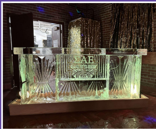
"Decorations for the undergraduates' Gatsby party"

The undergraduates continue to try to find ways to engage with the alumni community, and are very interested in getting to know as many alums as possible, learning the history and traditions of the chapter, seeking academic and career advice, and becoming part of the SAE and NYA networks. Whether it is a formal role with the chapter advisory board, a less formal role mentoring undergrads, or simply stopping by the house to have a meal with the guys and talk about the "good old days", your interaction, as an alum, with the active chapter is very valuable and will be quite rewarding. Please contact me for ways to engage or ideas for additional avenues we can create for positive alumni-active interaction.